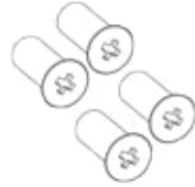
Mounting Screws (x4)